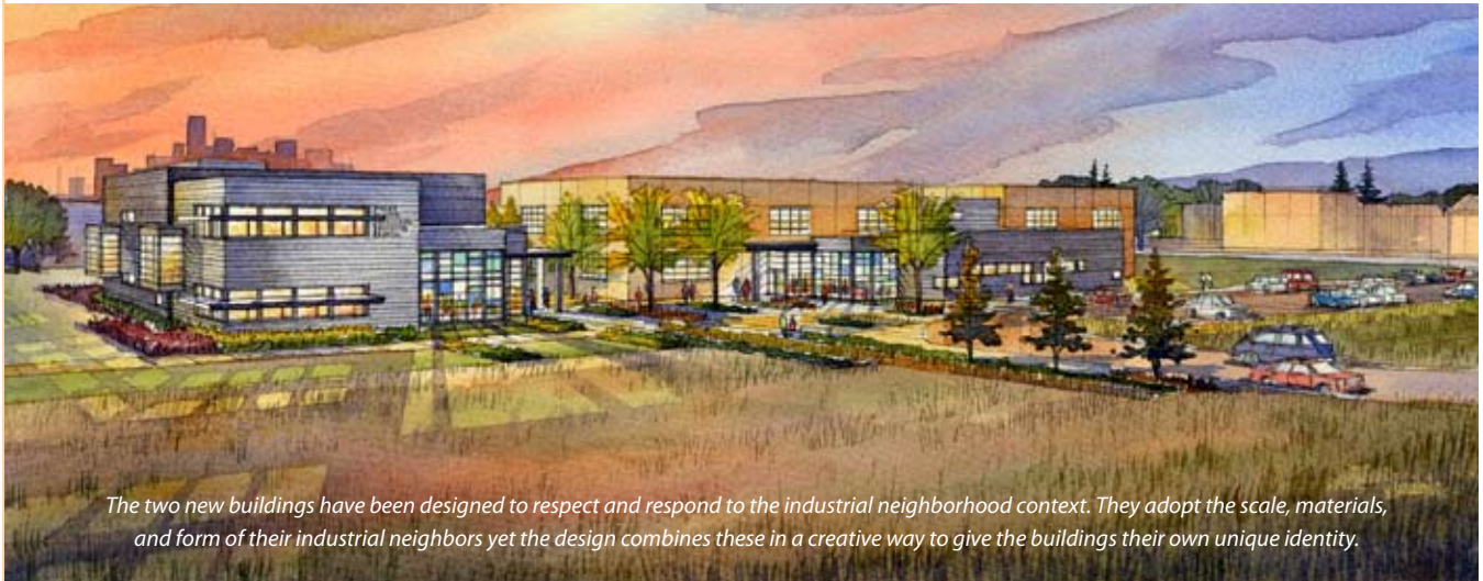
The two new buildings have been designed to respect and respond to the industrial neighborhood context. They adopt the scale, materials, and form of their industrial neighbors yet the design combines these in a creative way to give the buildings their own unique identity.

Stephanie Bower Architectural Illustrator and Schreiber Stirling & Lane Architects.